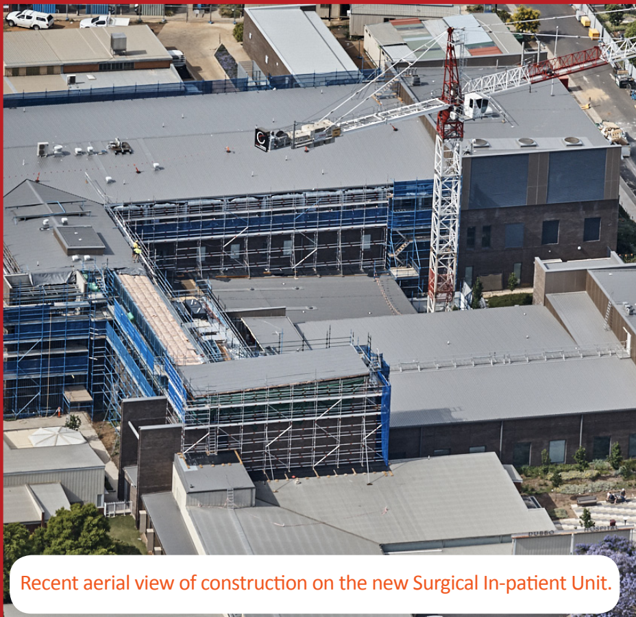
Recent aerial view of construction on the new Surgical In-patient Unit.

Members of the Dubbo Hospital executive team recently had a tour of the new Surgical In-patient Unit which is nearing completion. Work is continuing on the link corridor to the In-patient Unit and the extension of the stairwell and lift lobby. Patients and staff are scheduled to move in to the new unit in the first half of 2018.