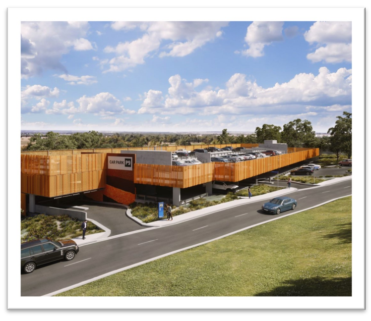
Above is an artist's impression of the new multi-storey car park on the western side of the campus, adjacent to the railway line.

Construction will start on the ground level car park in the coming weeks and the whole project is expected to be complete in 2022.