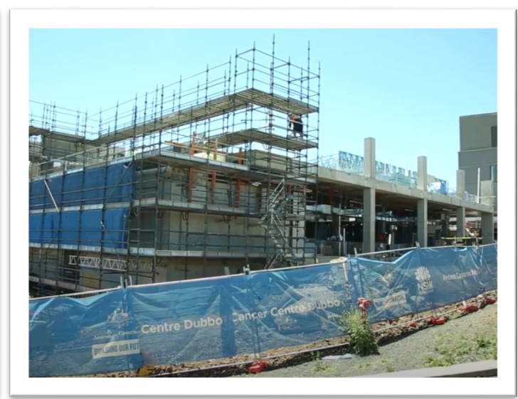
Above: The new Western Cancer Centre is starting to take shape with the concrete structure almost complete.