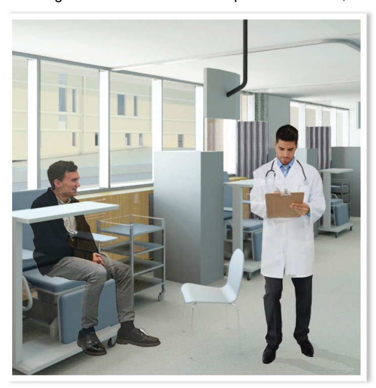
An artist's impression of a dialysis treatment spaces

The Renal Unit was originally going to receive an expansion and upgrade of its current space as part of Stages 1 and 2 of the redevelopment. However,