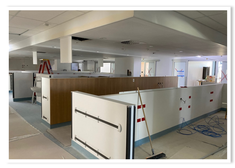
The new Coronary Care Unit is undergoing final finishing touches.