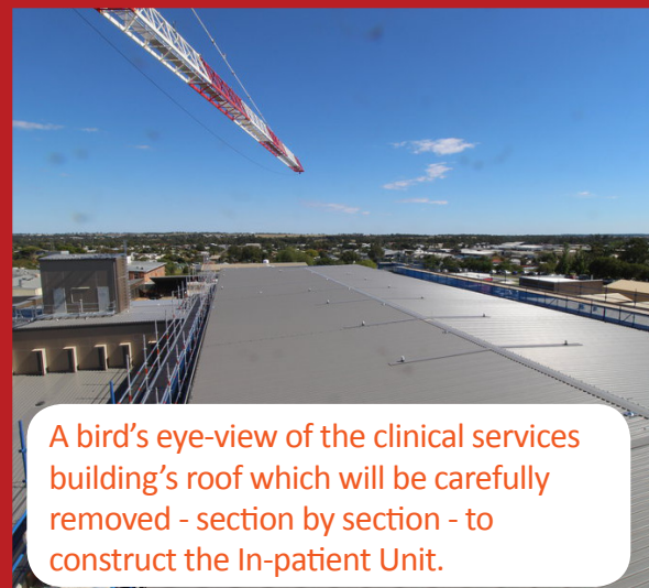
A bird's eye-view of the clinical services building's roof which will be carefully removed - section by section - to construct the In-patient Unit.

The NSW Government has committed $150 million to deliver Stages 3 and 4 of the Dubbo Hospital Redevelopment which includes a new Inpatient Unit, Emergency Department, Imaging Unit, Critical Care floor, Renal Unit (originally part of Stages 1 and 2 works) and Ambulatory Care Unit as well as new Ambulance bay, main entry and drop off zone.