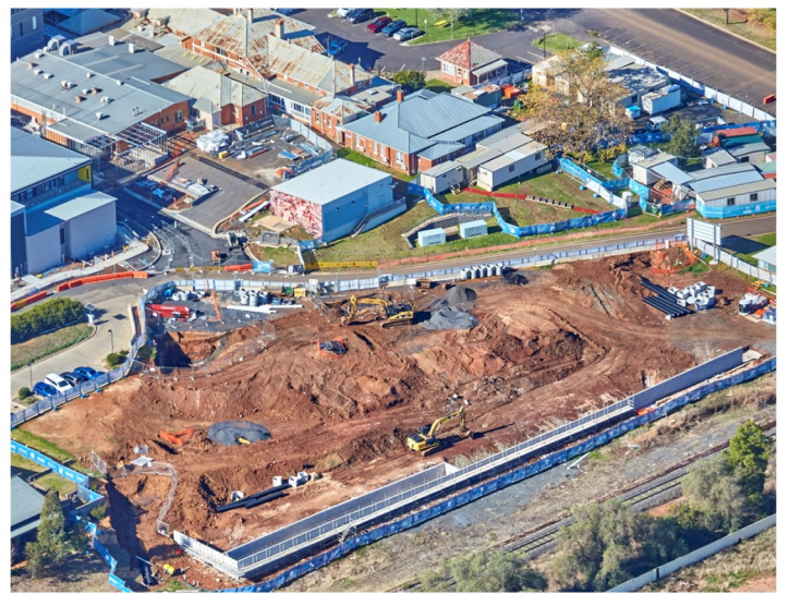
Site of the new multi-storey car park

These new car parks will deliver more than 350 additional spaces for staff, visitors and patients—supporting the uplift in services as a result of the hospital's major expansion and upgrade.