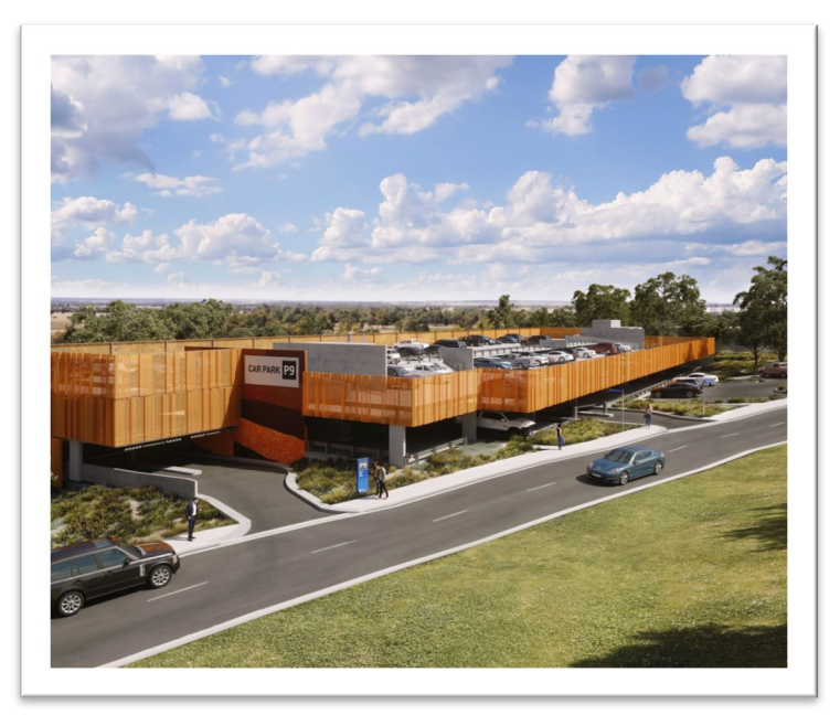
Above is an artist's impression of the new multi-storey car park on the western side of the campus, adjacent to the railway line.

Construction will start on the ground level car park in the coming weeks and the whole project is expected to be complete in 2022.