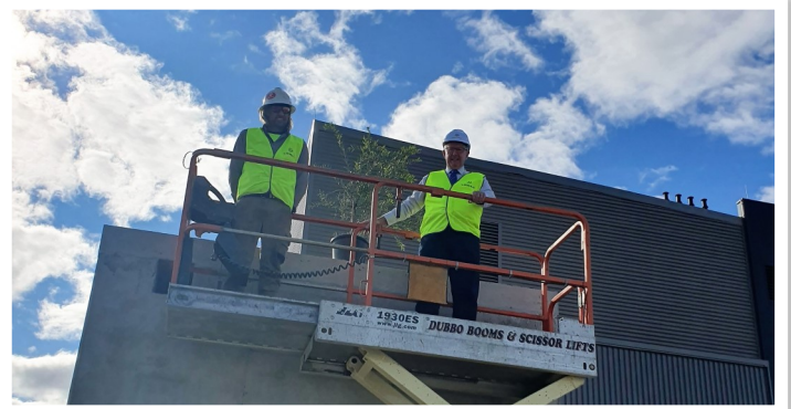
Mr Coultou places the tree on the highest point of construction during the topping out ceremony.

The Centre will include 16 chemotherapy spaces, a